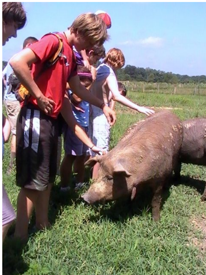
Summer Camp kids getting up close and personal with Petunia the Red Wattle sow.